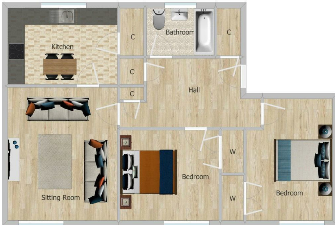
25b Chay Blyth Place